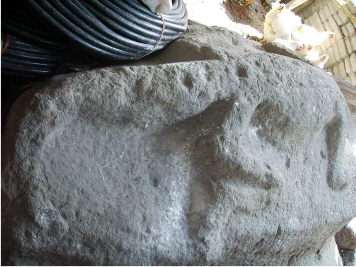
Alligator (headless) from house patio across the street from the Birth-Sacrifice Boulder.