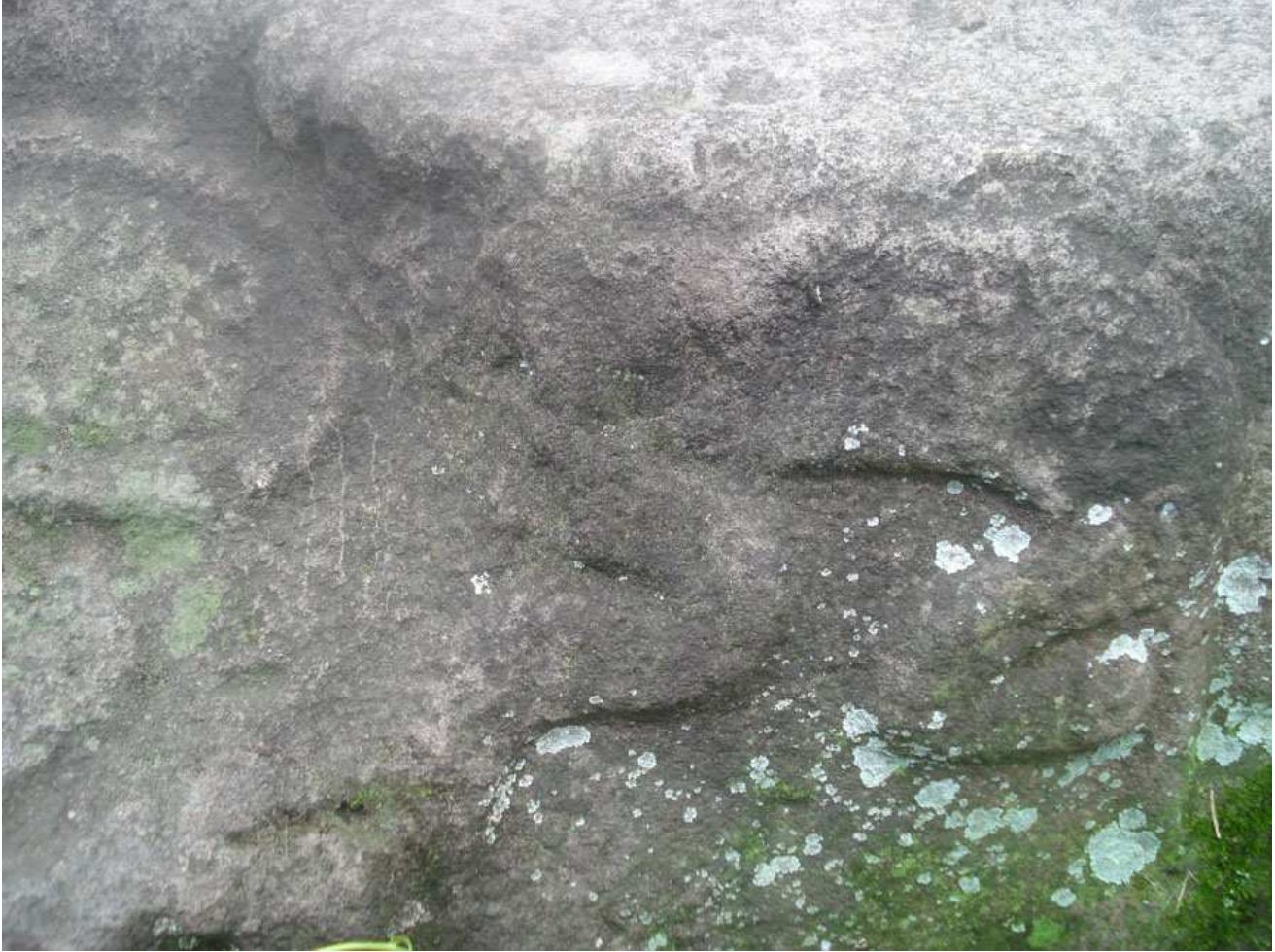
Figure 4. Odd two-legged, seemingly incomplete figure, to the right of the winged-warrior insectoid creature on the top face of the boulder.