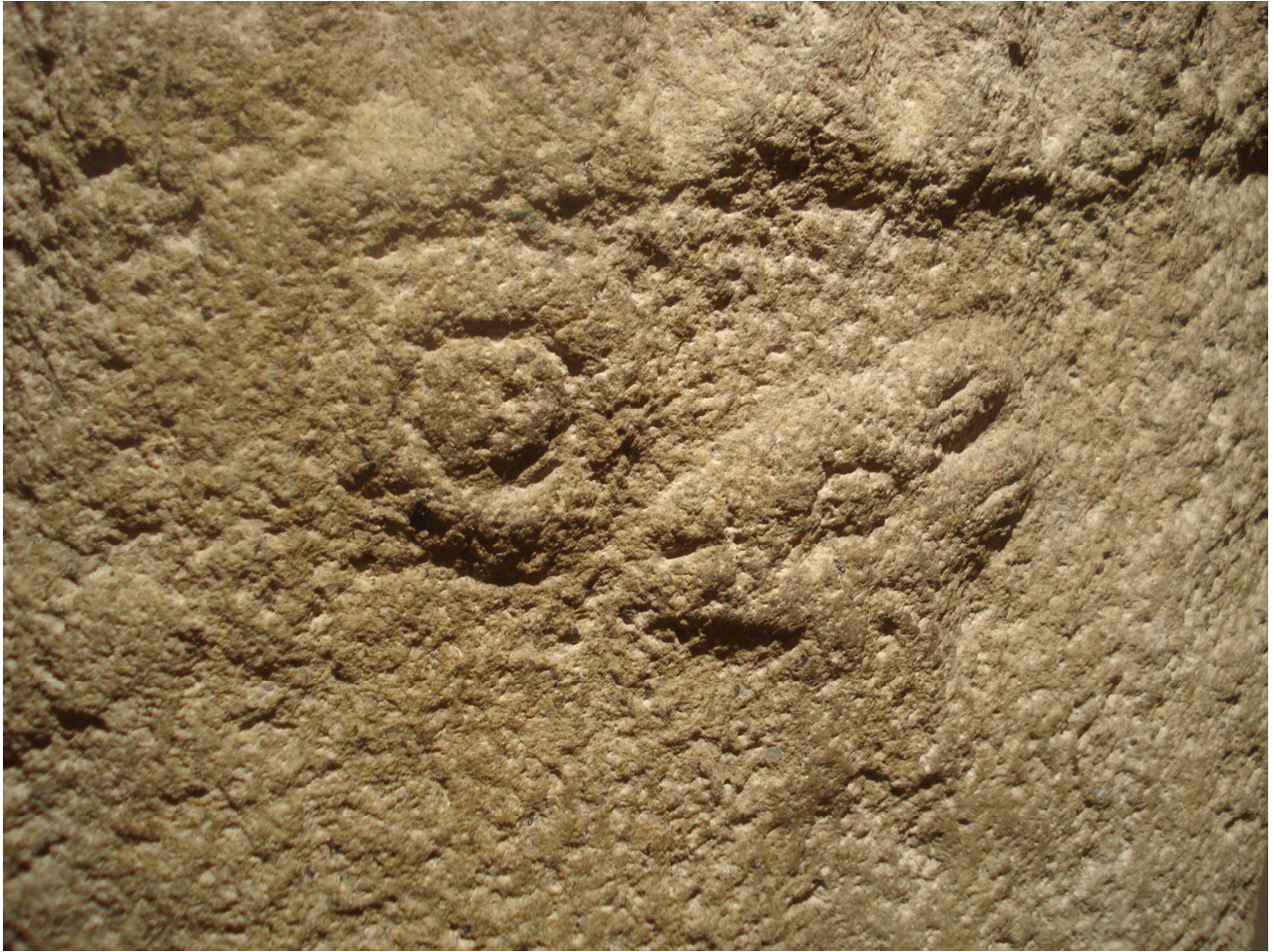
Figure 6. Deer head (?) and round dot on monument in the Tapachula museum, similar to the deer and dot on left side of monument. The day 1 Deer in the 260-day calendar?