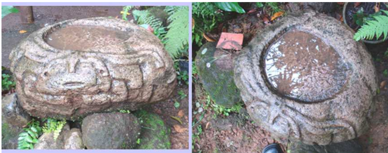
Figure 7. Carved stone near Izapa. Note reflection in the water.

It is tempting to date the boulder on some stylistic grounds to the same pre-Classic period of the Izapan stelae (400 BC to 50 AD) with which it shares certain iconographic motifs. Other elements may indicate post-Classic Central Mexican influence. Perhaps Carbon-14 dating will be possible. In my travels in the region I have noted that many pre-Classic and Classic Period artifacts have been found in the fincas (such as Casa Argovia) and other areas around Izapa. Much of this is understudied — known to locals but often missed by archaeologists interested in the pre-Classic realm of Soconusco. The New World Archaeological Foundation did the work at Izapa in the 1960s and continues to study and survey other nearby sites such as La Blanca and Paso de Amada. But carved boulders and sometimes stelae are often turned up in odd locations outside of the known archaeological temple sites. For example, while visiting Izapa in 2007, a homeowner near Tuxtla Chico showed us a carved figure in her backyard that was in the typical folded-arm position reminiscent of Olmec “pot-bellied boys” (also seen in later Maya iconography).