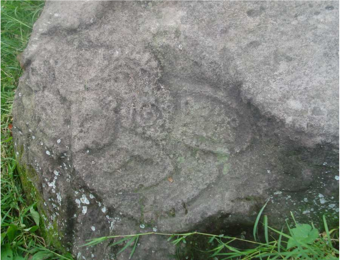
Figure 3. The prominent nose and face of this figure, with perhaps insectoid arms below to the right, can be seen in this image. The spiral design and wing-like body-extension can be seen to the right. A stylized headdress, not clear in this photo, suggest a royal personage or composite anthropomorphic deity-human. The face appears human, but the body appears insectoid. It was executed in a nice flat surface of the top part of the stone, suggesting importance. I have many more photos from various angles.