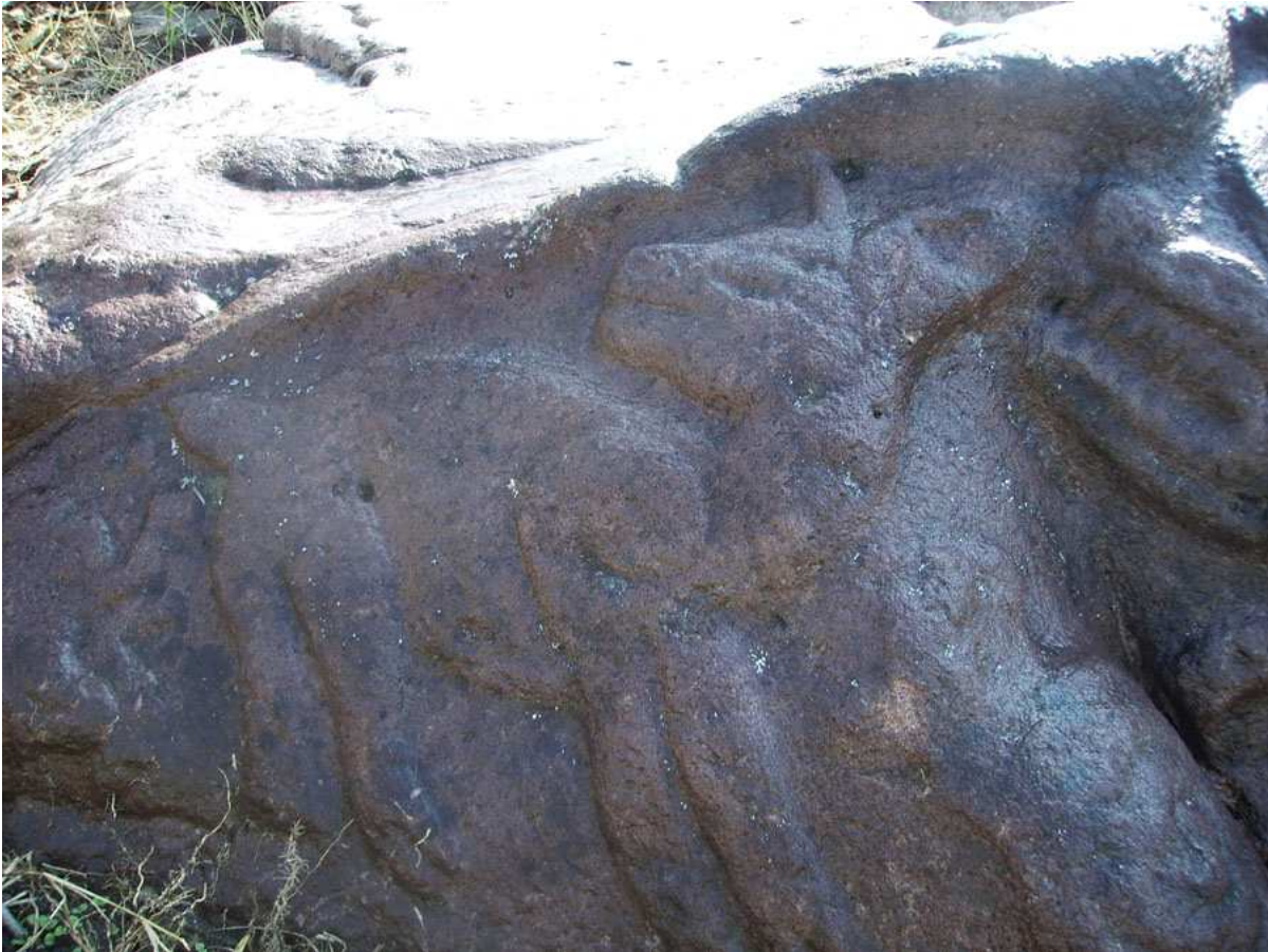
Figure 2b. Deer, full figure. Notice the caiman's mouth near the deer's ear. Photo by Rodolfo Juan Huerta.

Figure 2a (above). Here we see the caiman clearly. Notice the jagged cuts to its body on the right. The concentric circle image above its head may belong more to the grouping on the upper surface. It may be related to a “1” symbol portrayed on a carving preserved in the Tapachula museum (see Figure 6) — suggesting a later Central Mexican dating for this carving. The deer on this museum piece is also reminiscent of the deer next to the caiman's head, which is better seen in the photo below. The worked carving below the caiman is difficult to make out. It may be a snail or just a geometrical working, of which there are a few on this boulder. Photo by Rodolfo Juan Huerta.