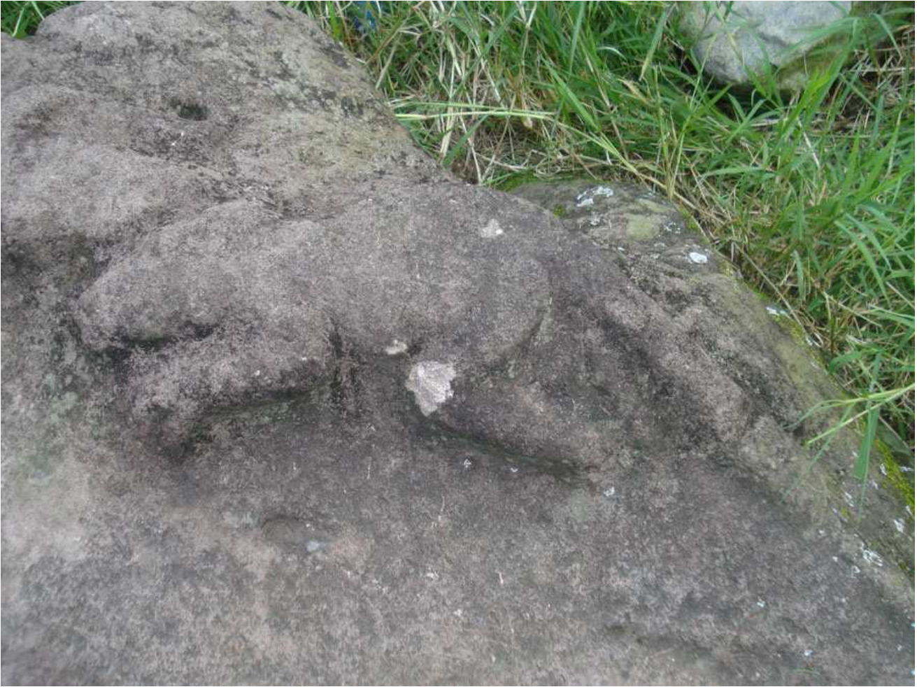
One of the figures on the top of the monument. Side view? Perhaps a large rodent?