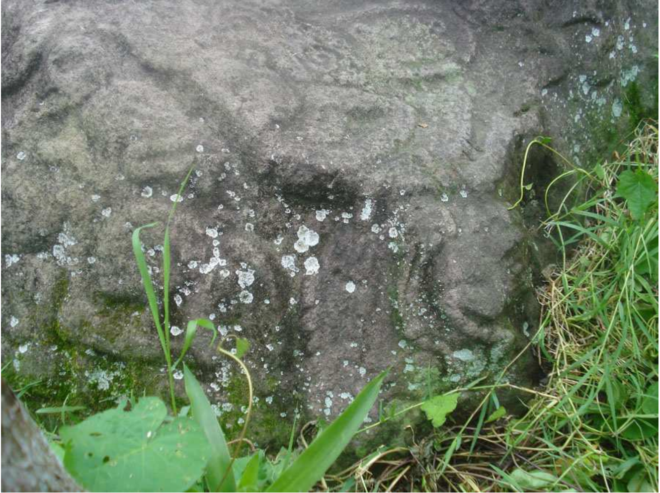
Here above, and outlined below, one can see the fish and the pelican-like bird (a cormorant?).