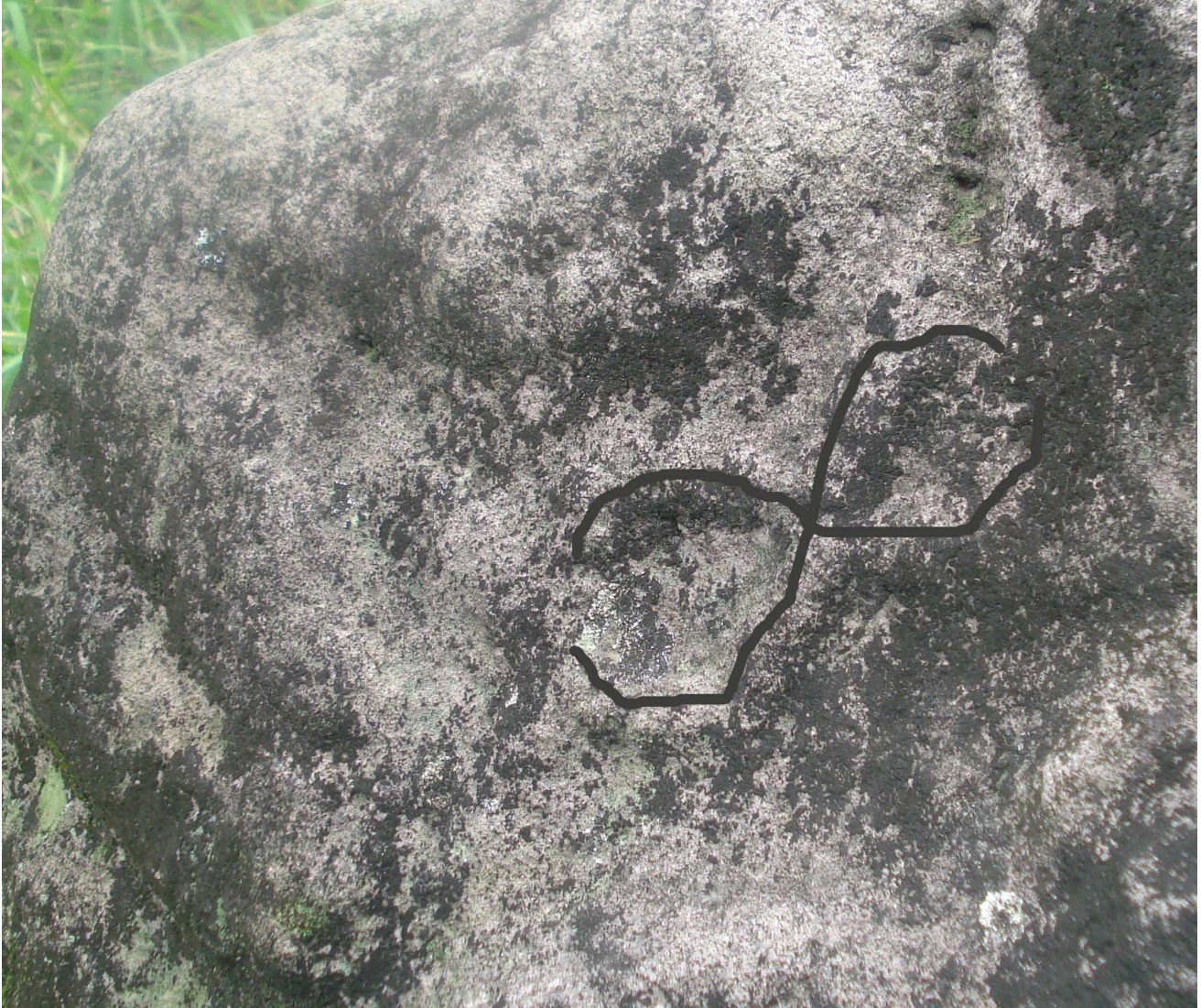
Figure 5. Odd abstract design next to frog, above birthing woman. Photo and line drawing by the author.

Six images in the following Photo Sequence #1 provide other views of the various design elements in the super-narrative of the carved monument. All remaining photos and line drawings are by the author unless otherwise stated.