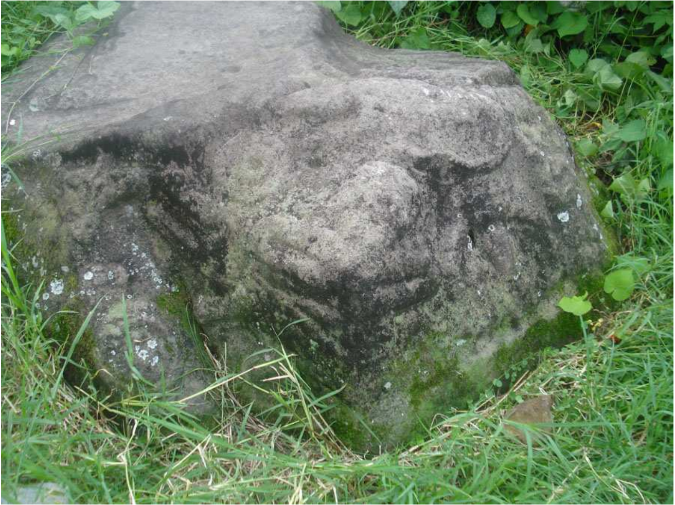
Frog body formed into left corner, above incensario on the front face, just to the right of the corner.