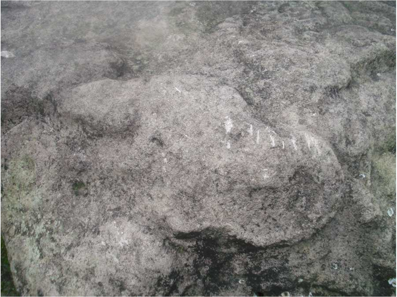
Figure with tail on top of the monument. Caiman / alligator?