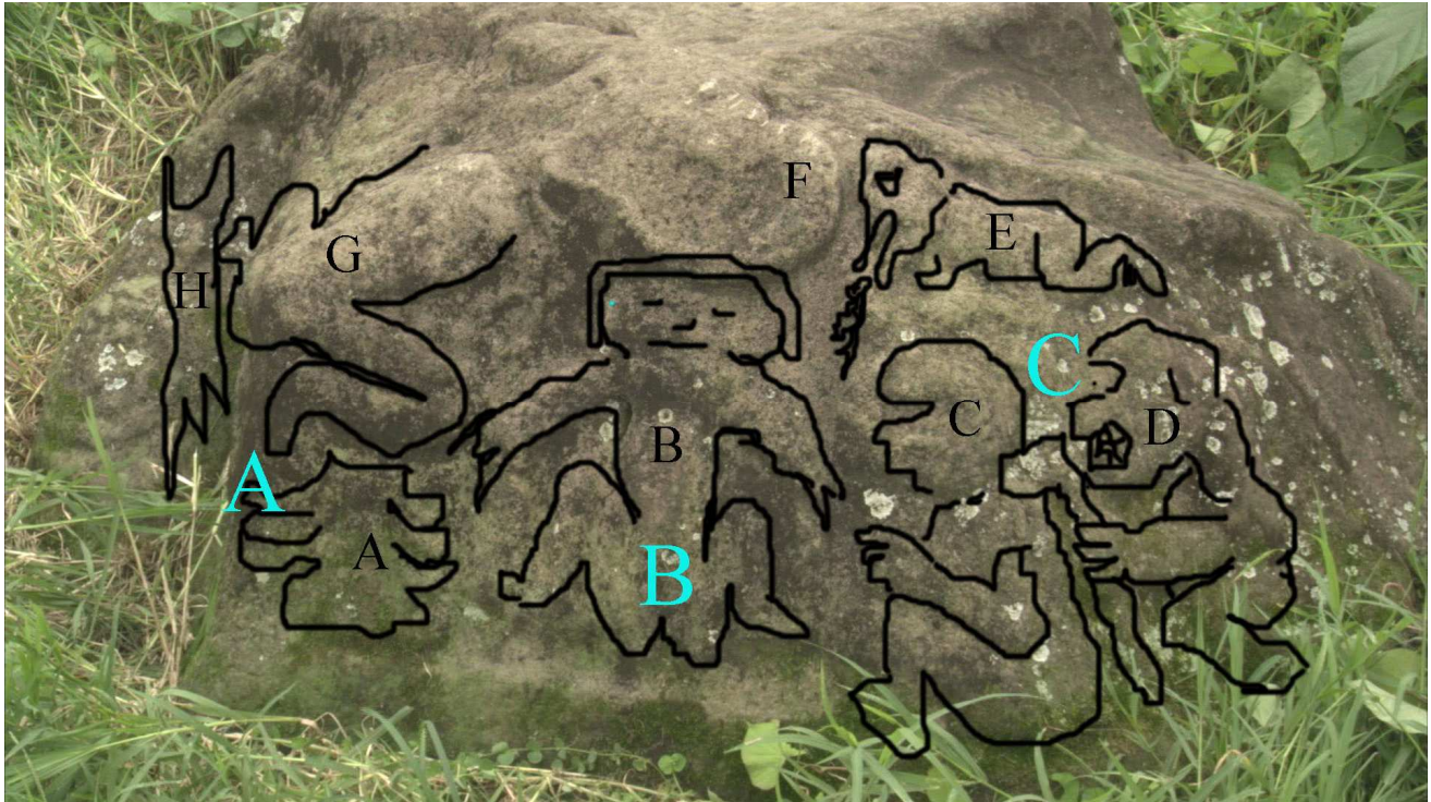
Figure 8. Sections on the left (A), middle (B), and right (C) sides of the monument. The imagery on the top face and far right and left sides are excluded. Photo and drawing by the author.

To summarize, a master-image follows — an outline drawing and brief overview of the central sections of the Birth-Sacrifice Monument: