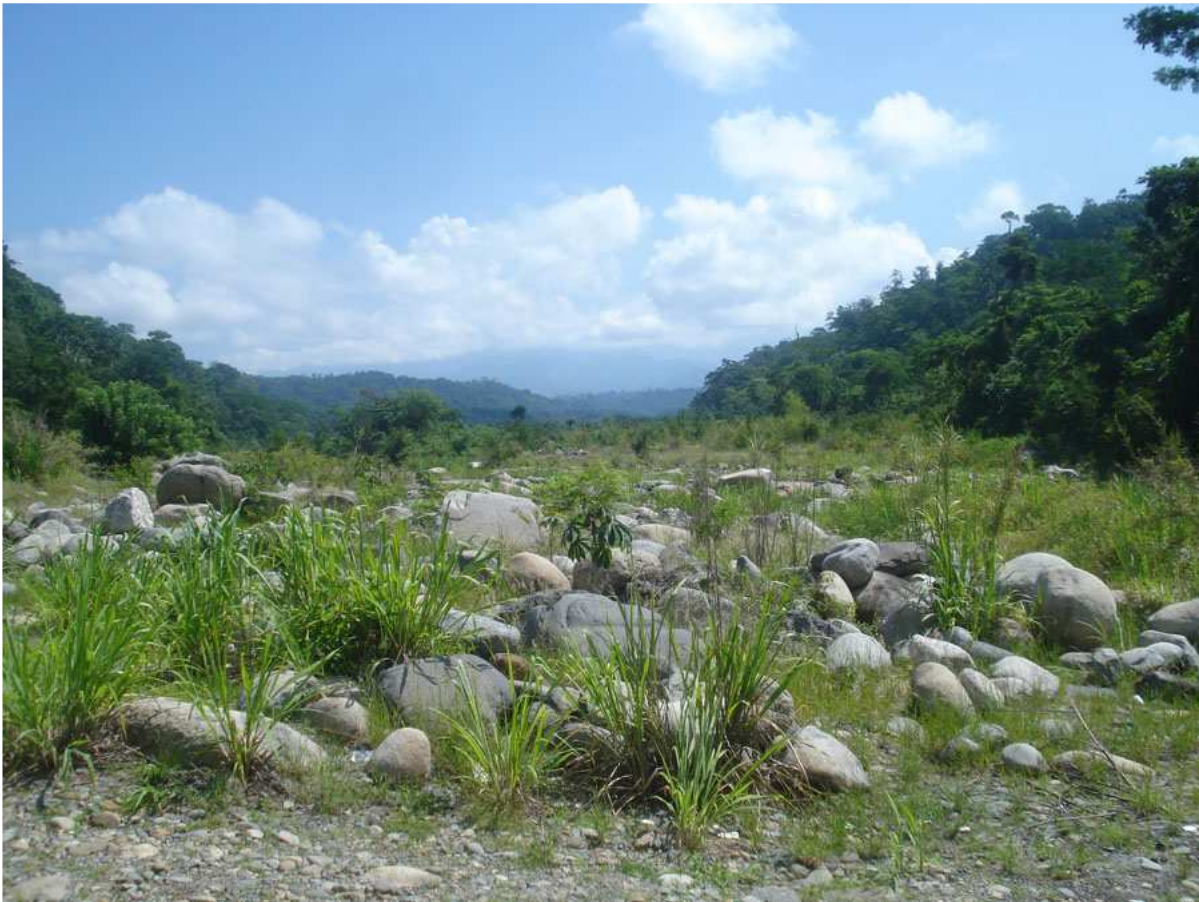
Boulder field outside of Tapachula with boulders of many different types, washed down from the high mountains and volcanic peaks.