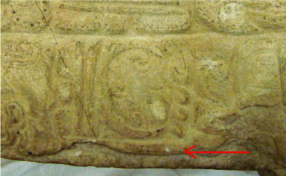
Photo sequence #1, image 4. Looking straight down. This final photo gives an indication of the space available for additional bars or dots, as well as the trough between the surviving bar and the missing part (indicated by the red arrow).