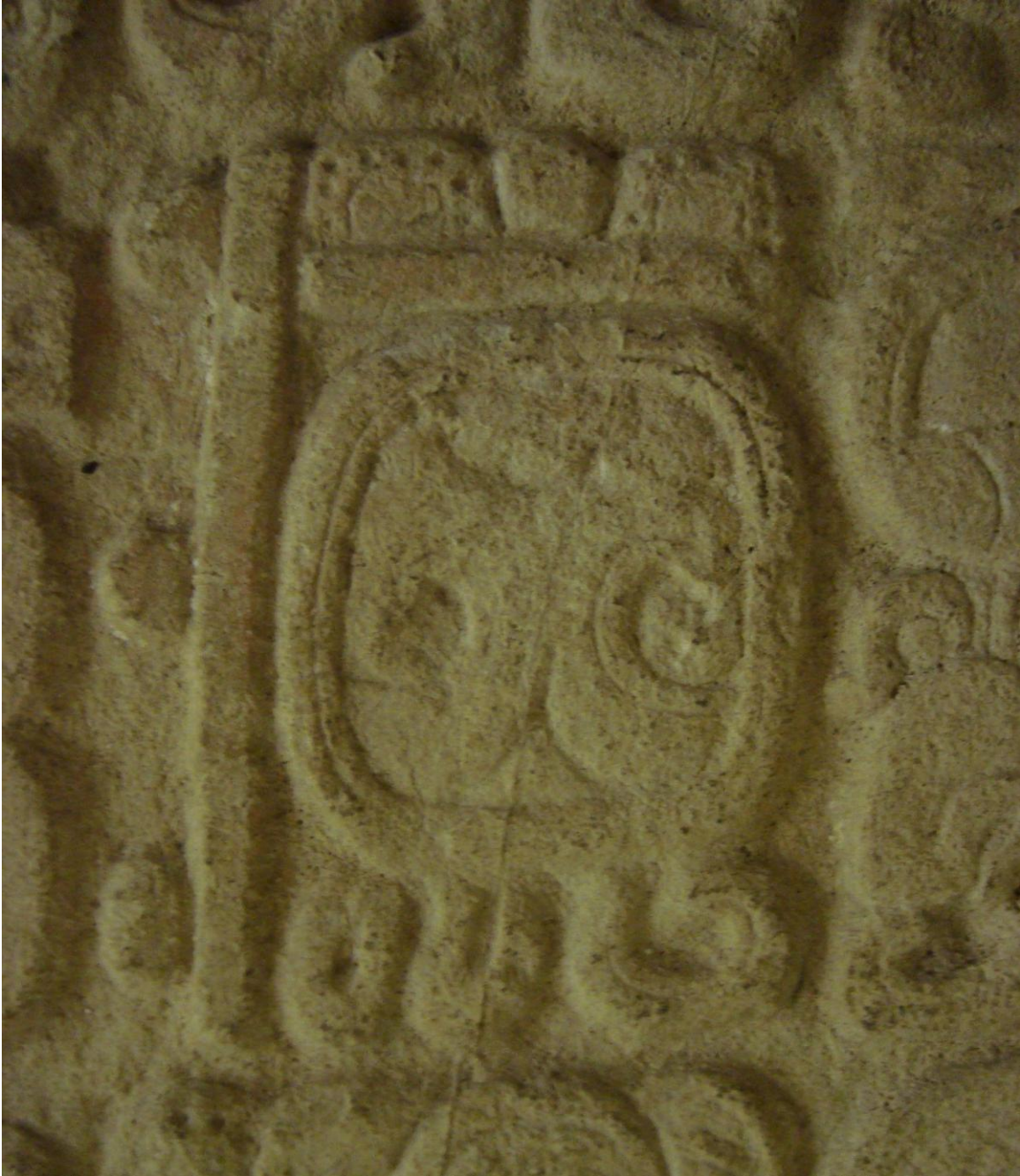
Figure 2. Glyph-block I3. The areas between the dots and the bar have less of a declivity than open areas. The declivity between two bars would be of uniform depth, as appears evident in the declivity that survives next to the bar in glyph-block E4.

The observable width of the trough on the broken K' in DN of E4, before the stucco splits, is fairly substantially, and no dots are pressed up against the surviving bar. If my observations have merit, then there is a good possibility that a bar split off and the K' in portion of the DN would be "10" (two bars). Lord Jaguar's birthday would therefore be November 28, 612 AD (Julian), 12 Ajaw in the 260-day calendar. Notice, however, that