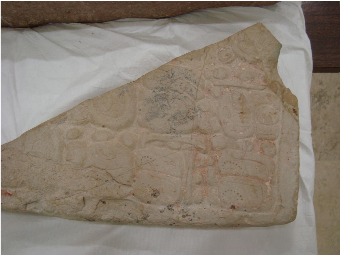
Figure 5. Note red paint in the lower right corner glyph (P1), and dark blue pigment in the glyph-block above and to the left (O2).

One final observation. As noted by Gronemeyer, the top portion of the monument is distinctly tinted with the remnants of red paint. I noticed that one glyph block (at O2) in the right flange appears to be tinted with dark blue paint (see Figure 5 below).