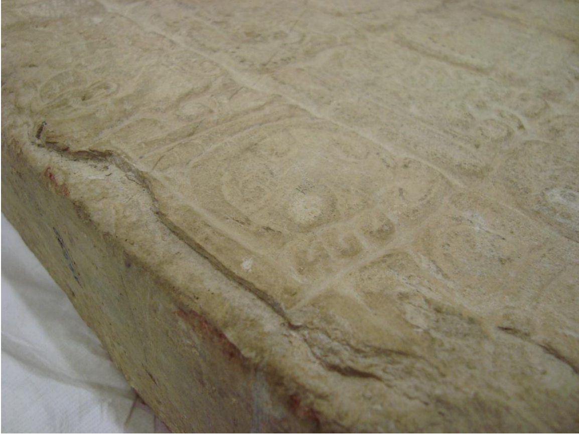
Photo Sequence #1, image 1. Photo of glyph-block E4 showing the surviving vertical bar of the K in portion of the Distance Number, and the missing part to the left. The stucco covering has chipped off in a near-uniform lengthwise wedge.