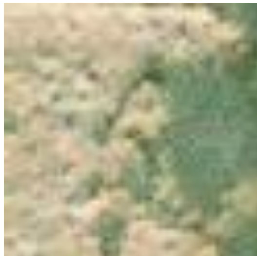
Figure 6. Close-up of the C-shaped element and its hooked lines within the P4 glyph. See also Figures 3 and 4. Unaltered, unsharpened image.