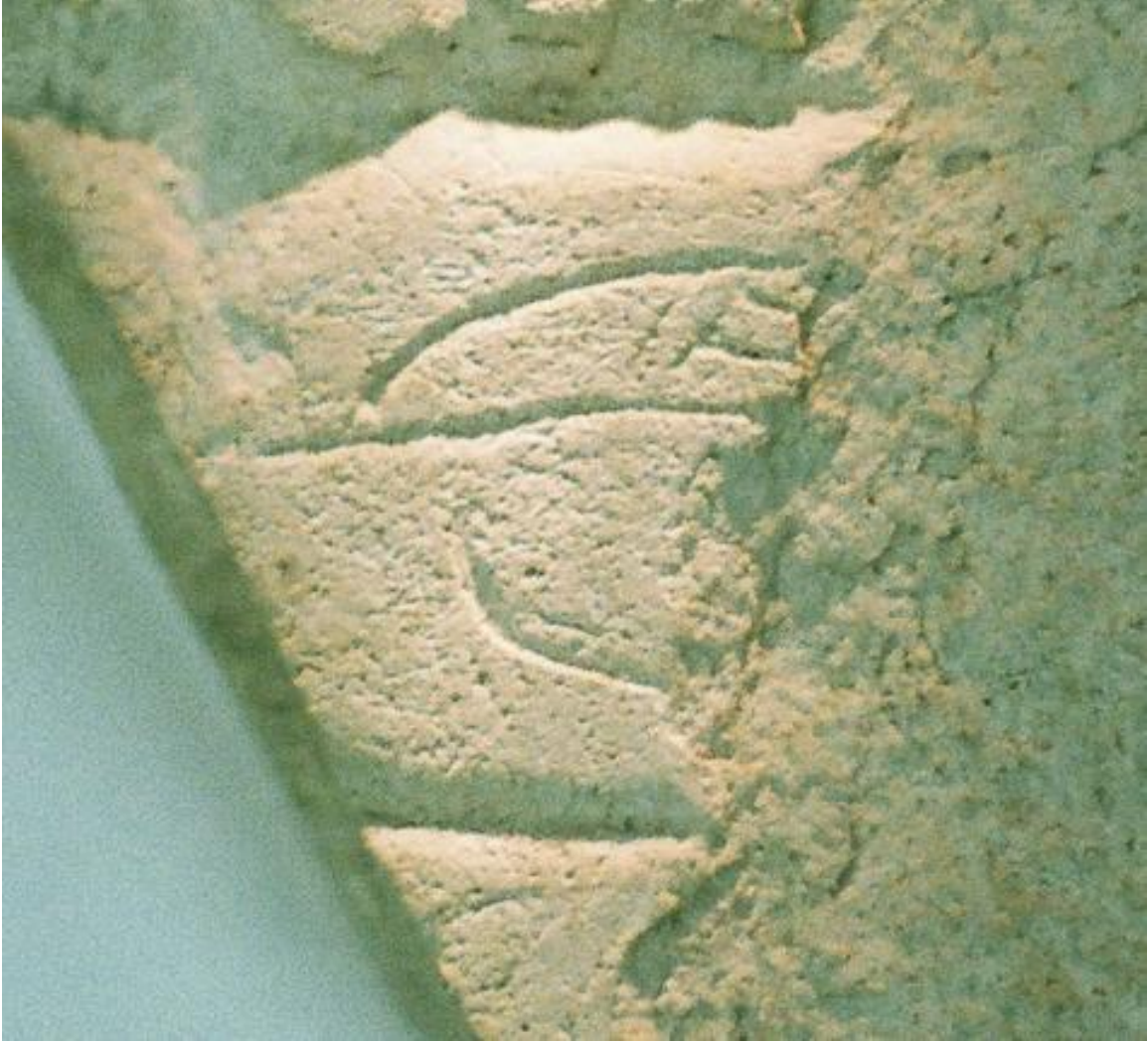
Figure 3. Close-up of the P4 glyph-block. Notice the hooked form of the element just below the longest horizontal line.