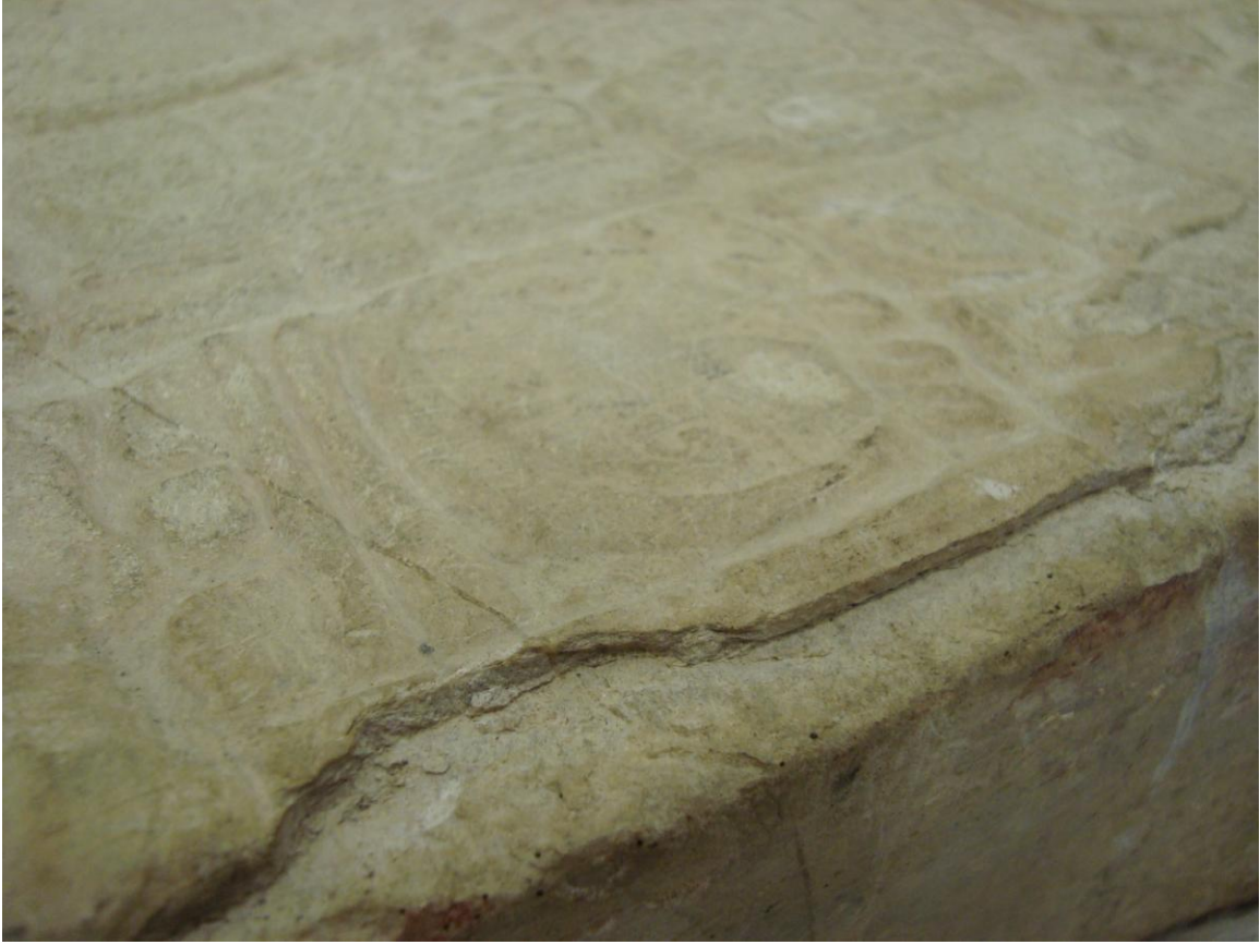
Photo Sequence #1, image 2. Photo of glyph-block E4 from a different angle.