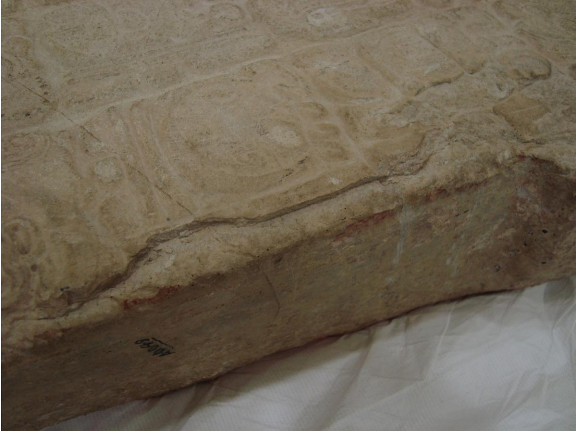
Photo Sequence #1, image 3 (above). Photo of glyph-block E4, slightly zoomed out